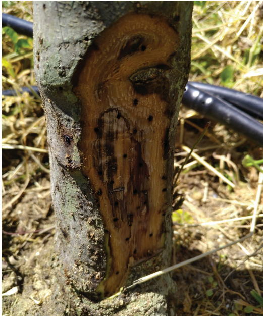
Figure 2. Holes inside the wood at the base of the trunk of sweet chestnut tree.